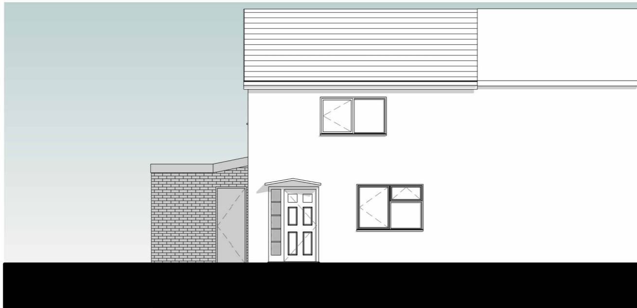
1 Existing Front Elevation 1 : 100