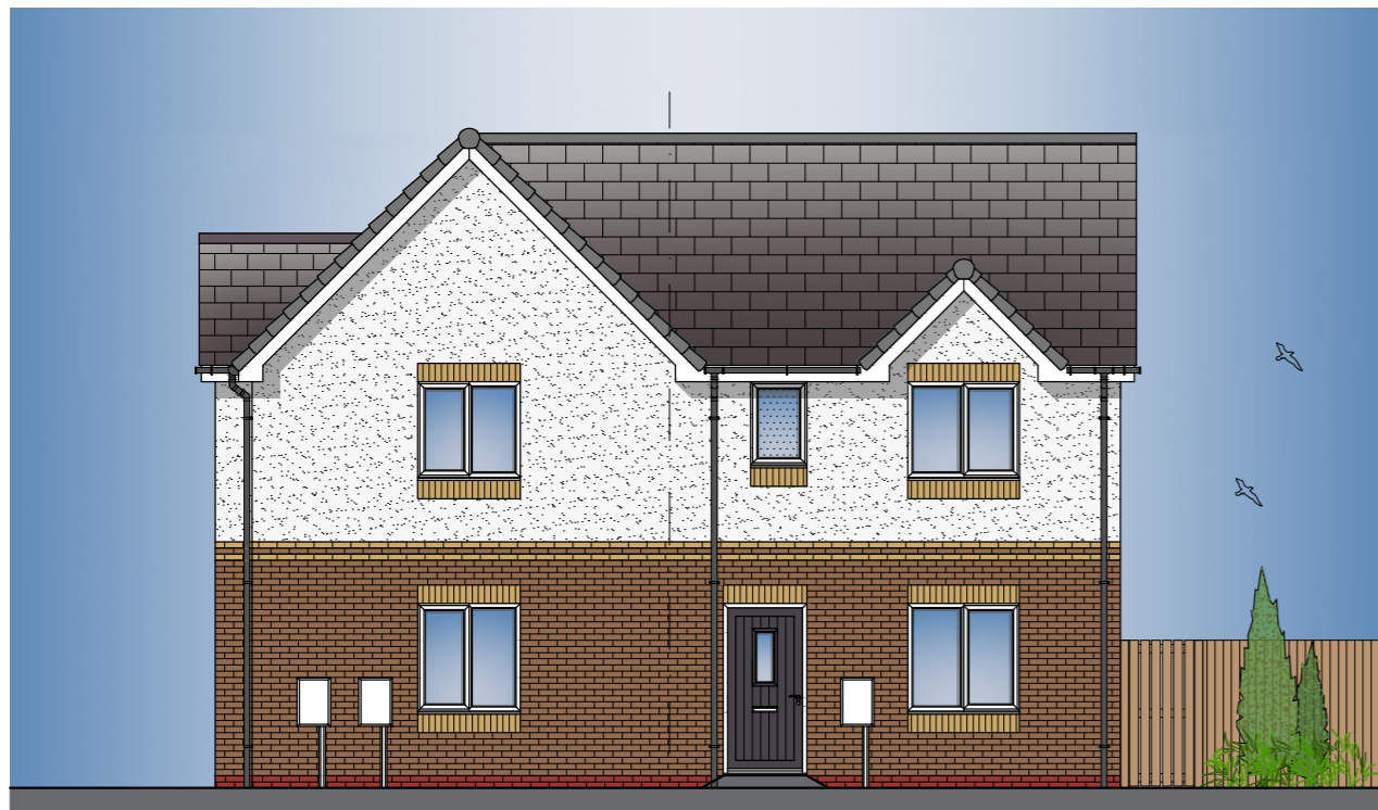
TYPE D 2B4P 81 (AS) FRONT ELEVATION - Semi-Detached