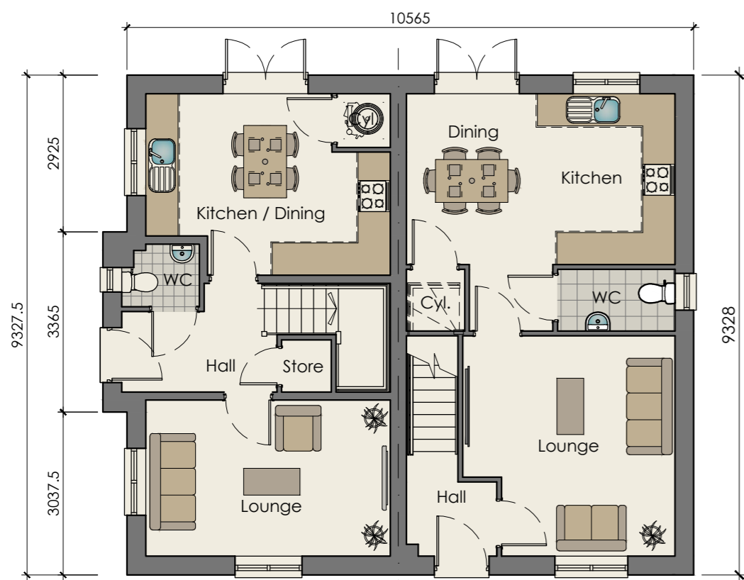
TYPE D 2B4P 81 Aspect (AS) GROUND FLOOR PLAN - Semi-Detached