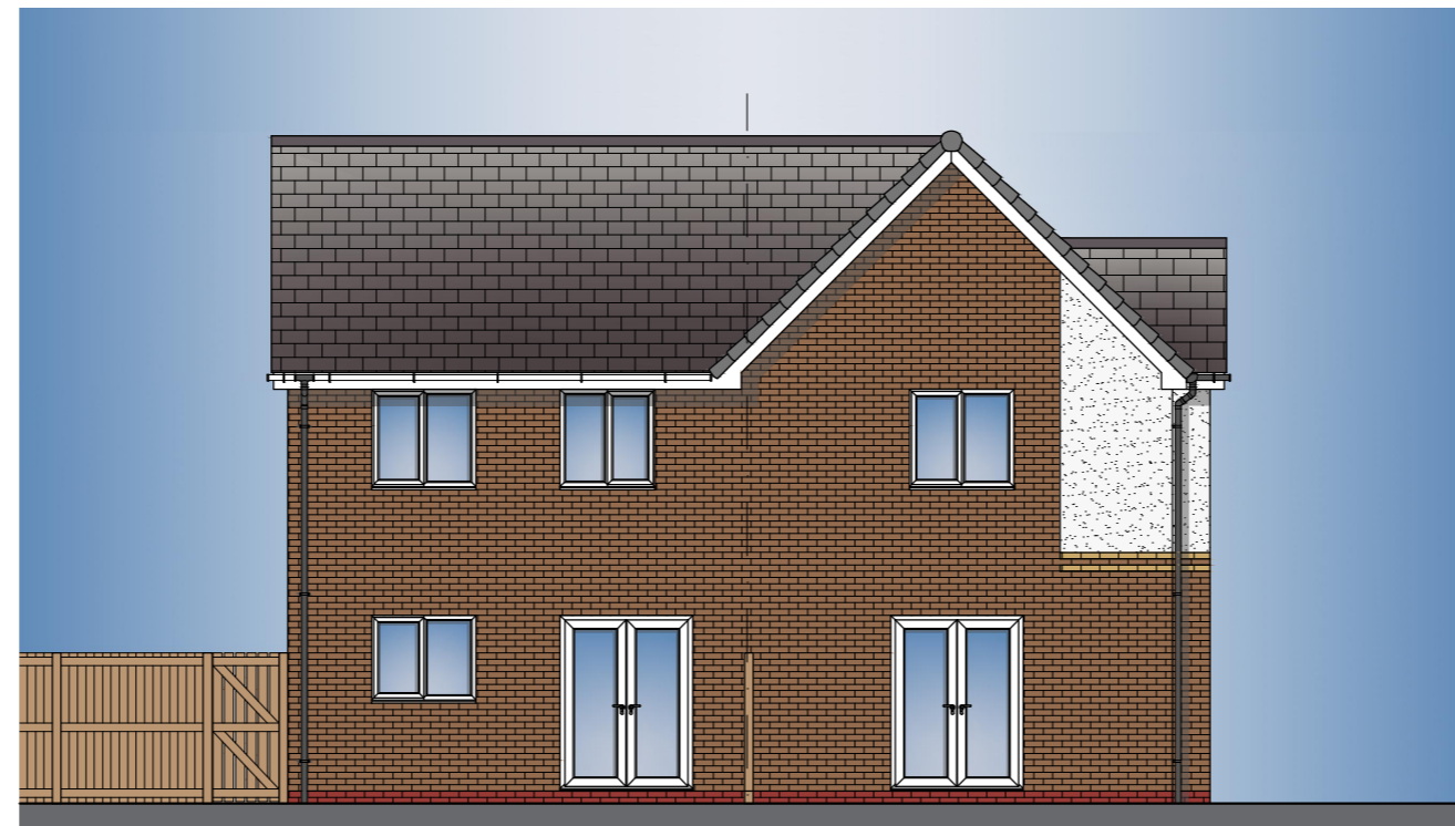
TYPE F 3B4P 86 (OPP) REAR ELEVATION