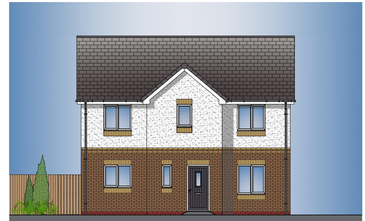
TYPE D 2B4P 81 Aspect (AS) FRONT ELEVATION