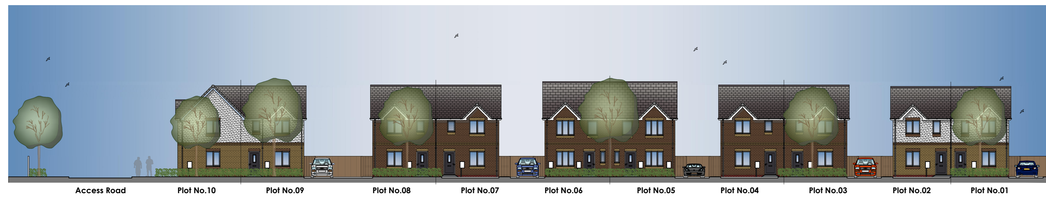
Street Scene Elevation A-A