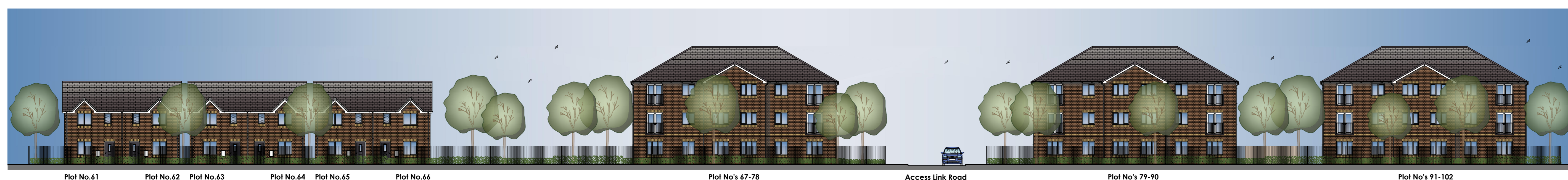
Street Scene Elevation D-D