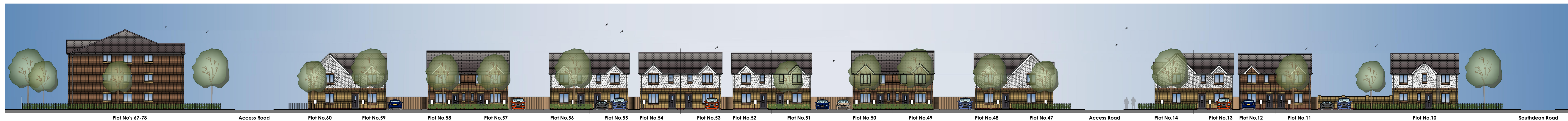
Street Scene Elevation B-B