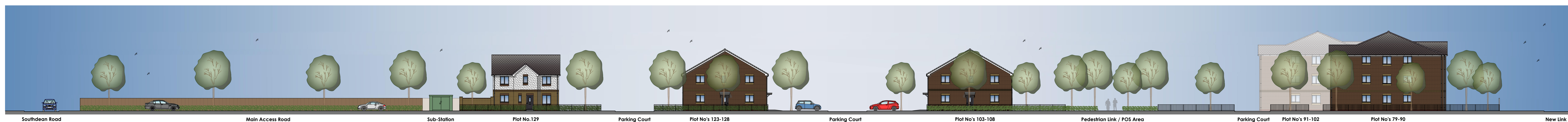
Street Scene Elevation C-C