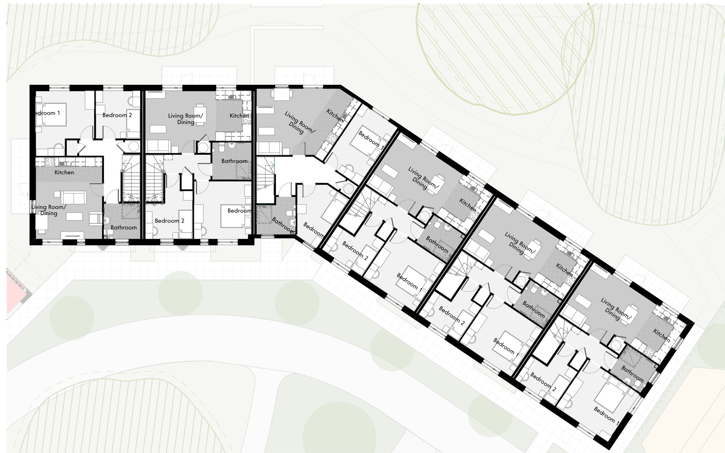
FIRST FLOOR PLAN - 1:150 @A1