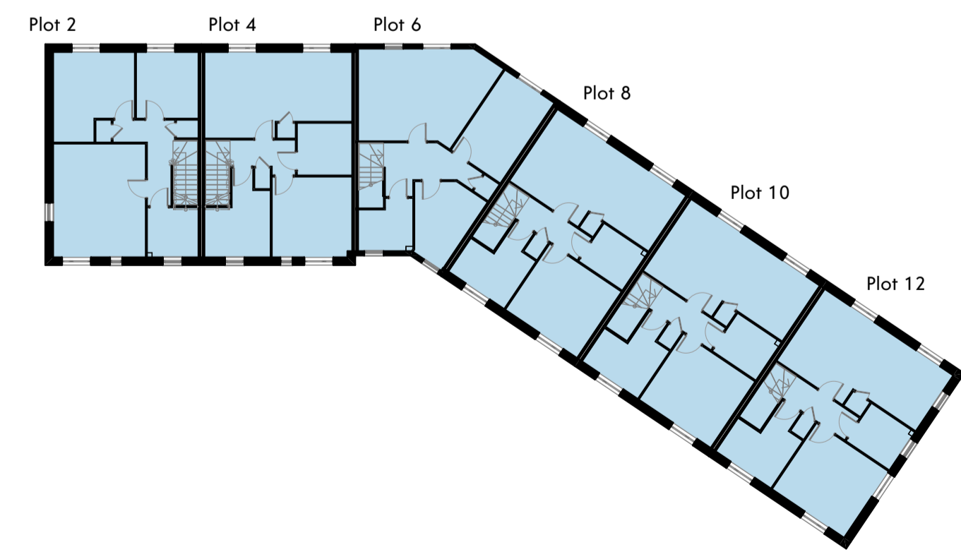
FIRST FLOOR APARTMENT TYPES

This drawing is the property of GWP Architects. Copyright is reserved by them and the drawing is issued on the condition that it is not copied, reproduced, reprinted, or distributed in any form without the prior written consent of GWP Architects. All drawings and specifications should be read in conjunction with the project health and safety plan. Any possible conflicts should be presented to the Project Manager. All work to be carried out in accordance with current Building Regulations. Contractors must verify all dimensions at the job before commencing any work or making shop drawings. Written dimensions should be taken. Do not scale off drawing. Do not take digital dimensions from this drawing. Any discrepancies to be reported to the Architect.