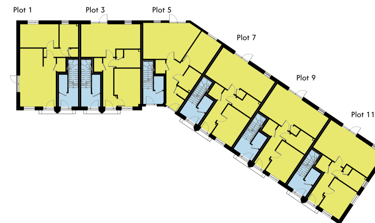
GROUND FLOOR APARTMENT TYPES

1b/2p = 6 No. 2b/3p = 6 No. TOTAL = 12 No. Apartments NDSS 1b/2p = 50m 2 NDSS 2b/3p = 61m 2