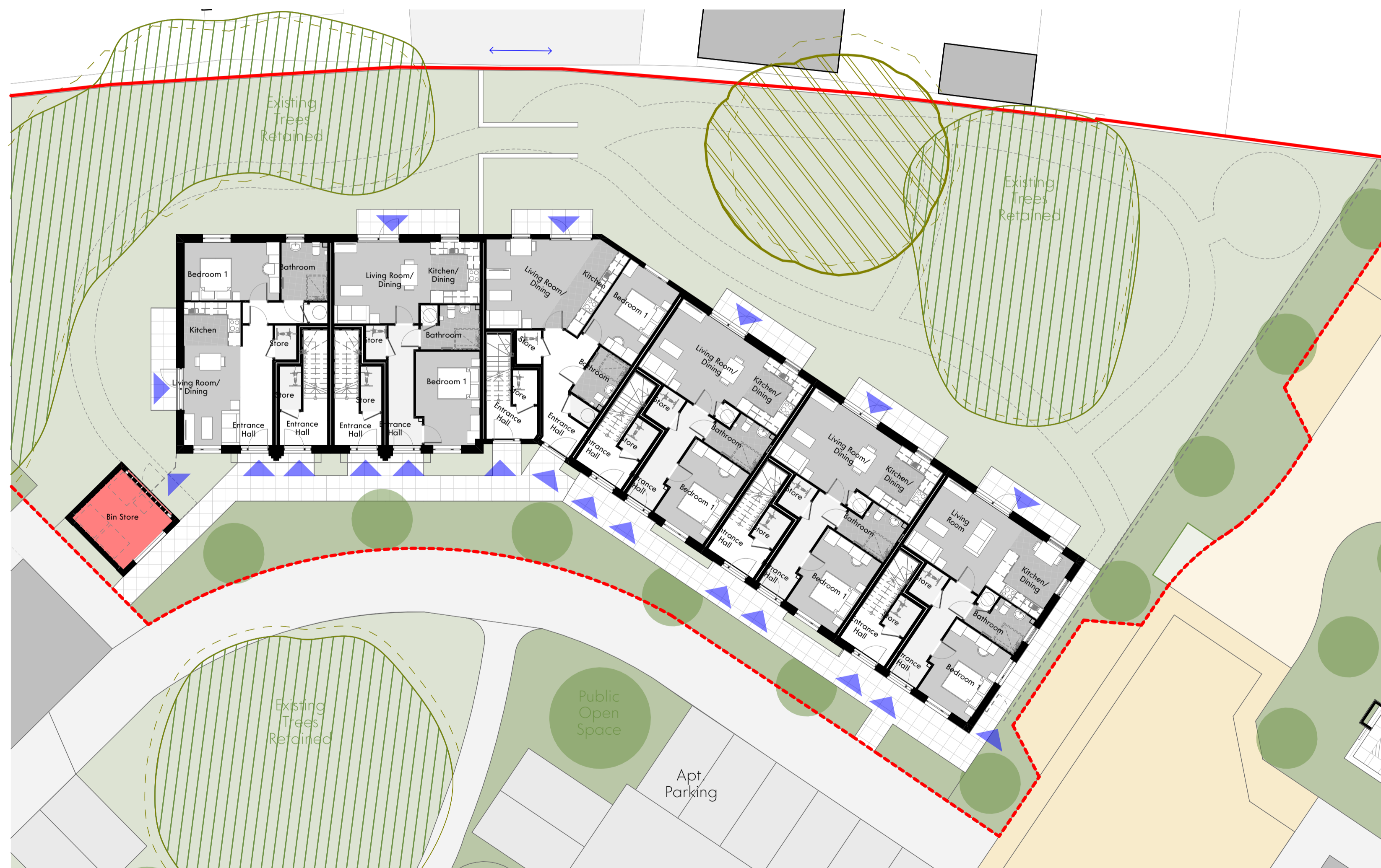
GROUND FLOOR PLAN - 1:150 @A1