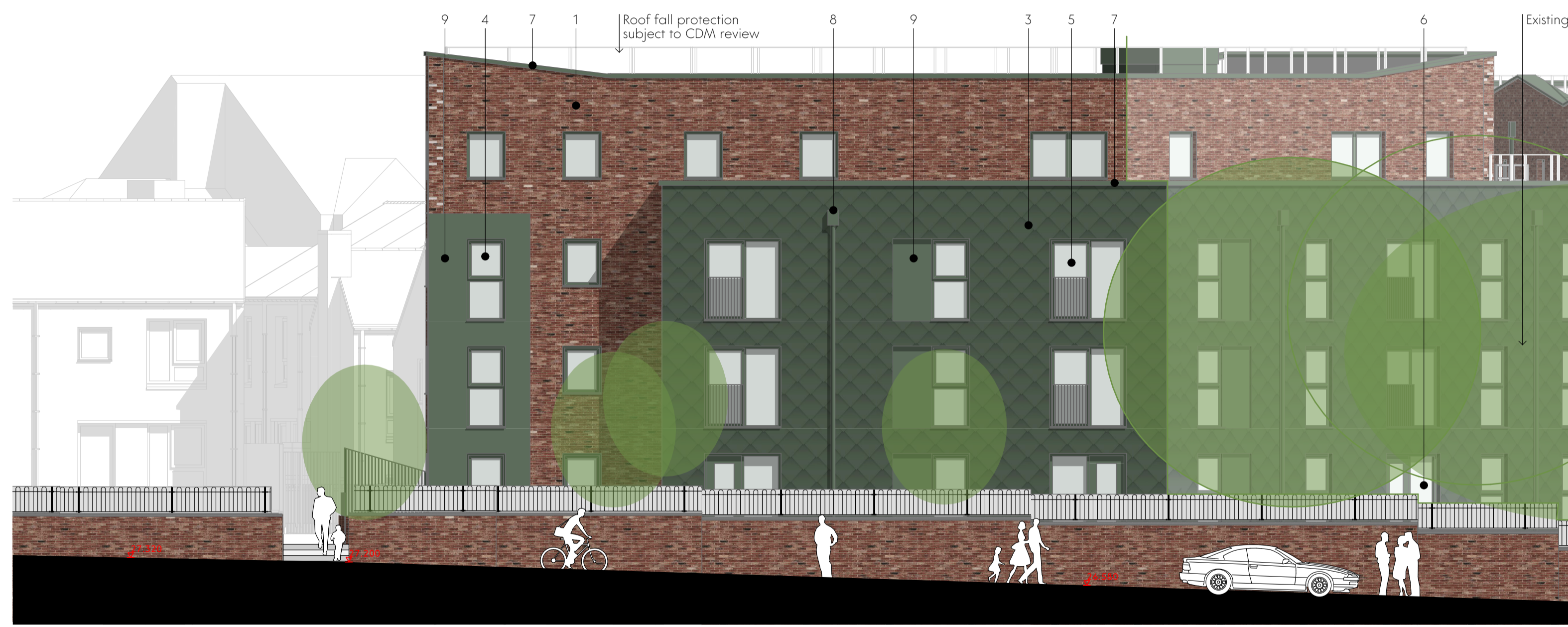
E-21 Proposed Elevation