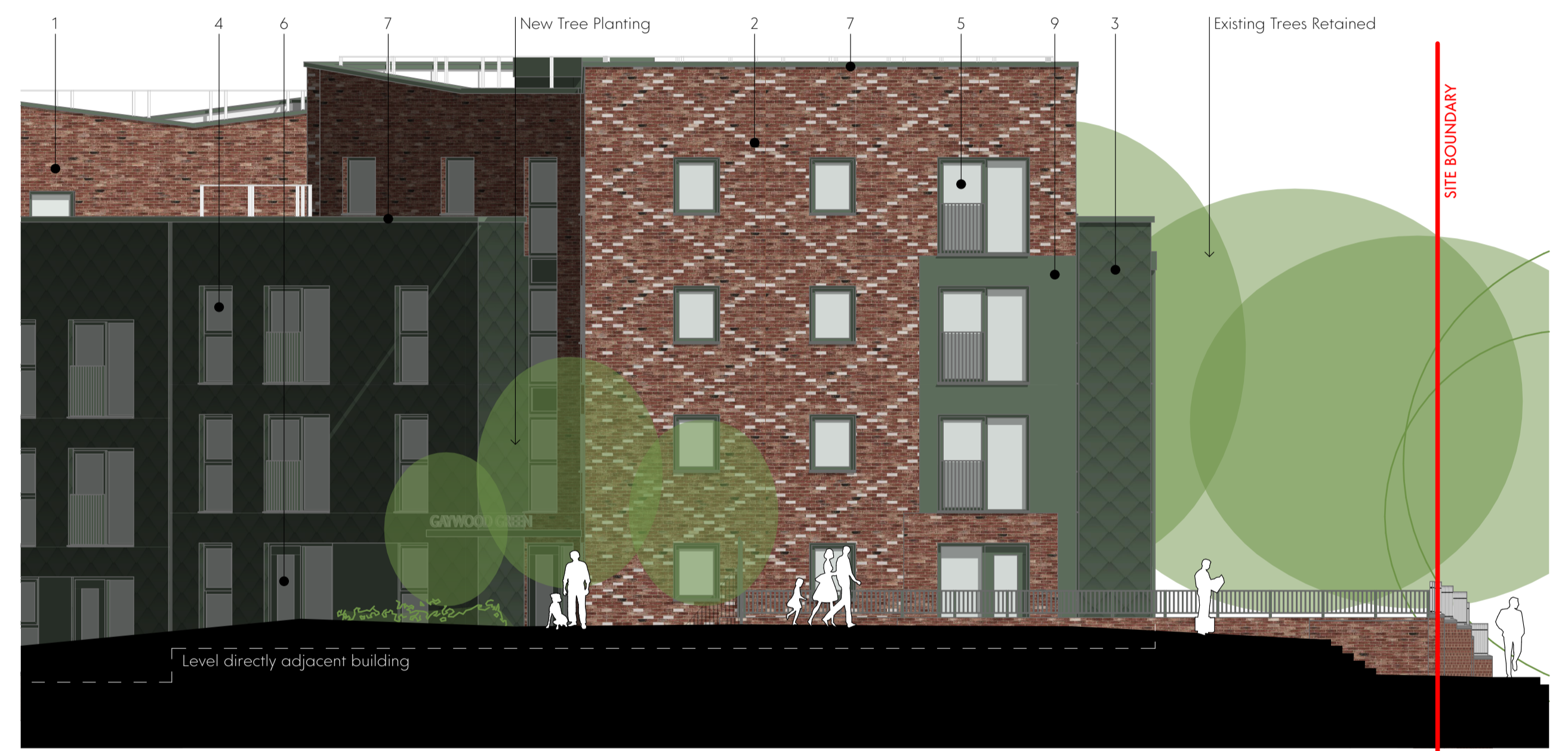
E-22 Proposed Elevation