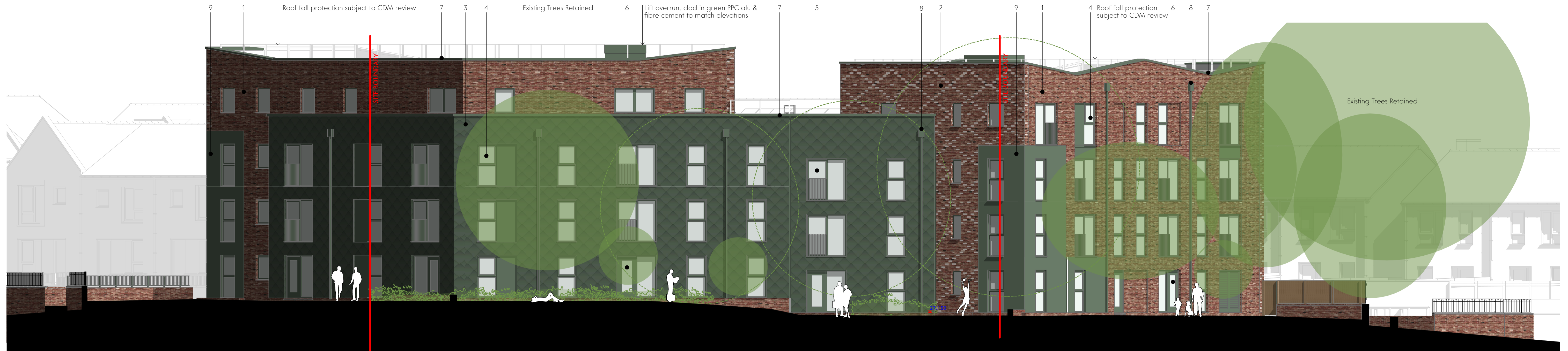
E-20 Proposed Elevation