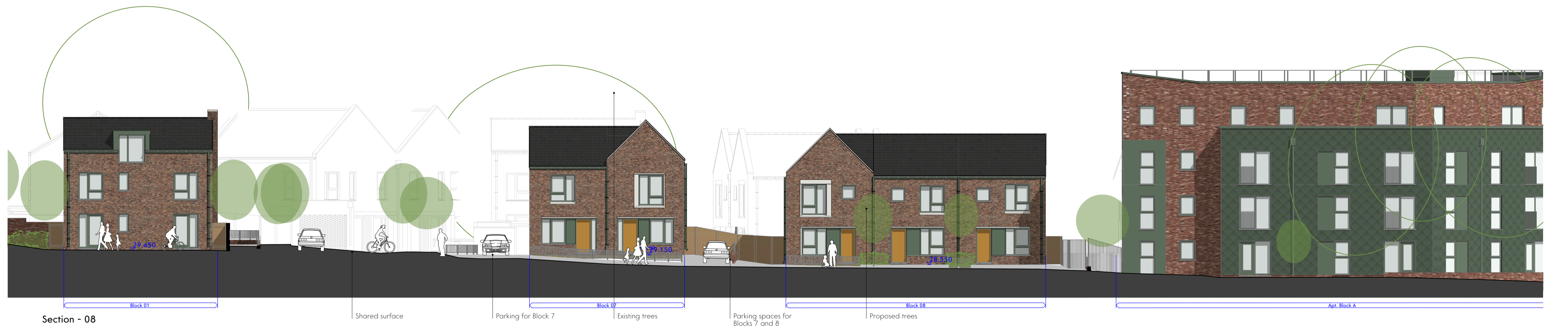
Section - 08