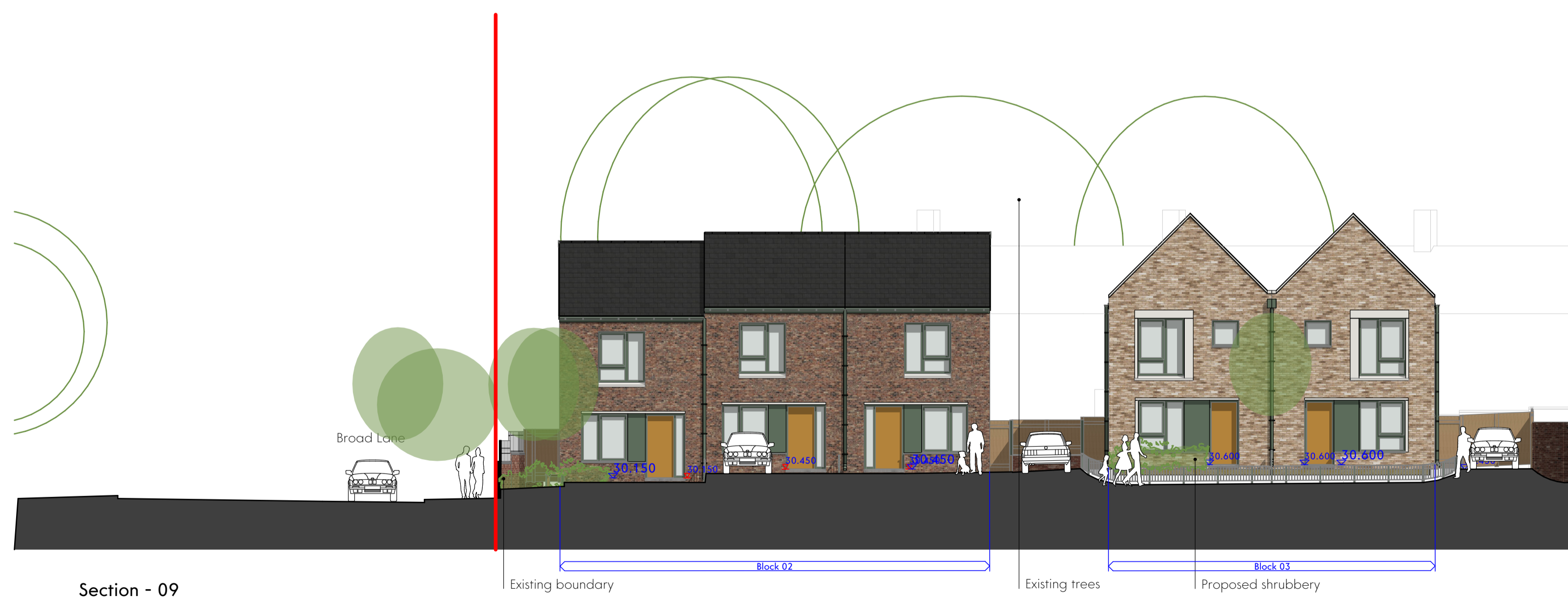
Section - 09