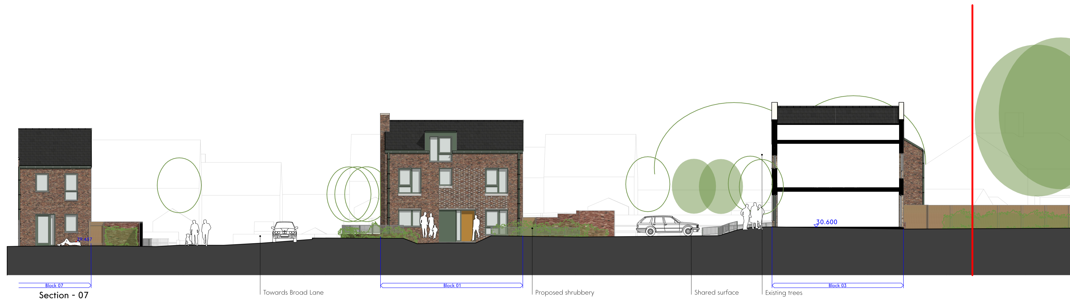
Section - 07