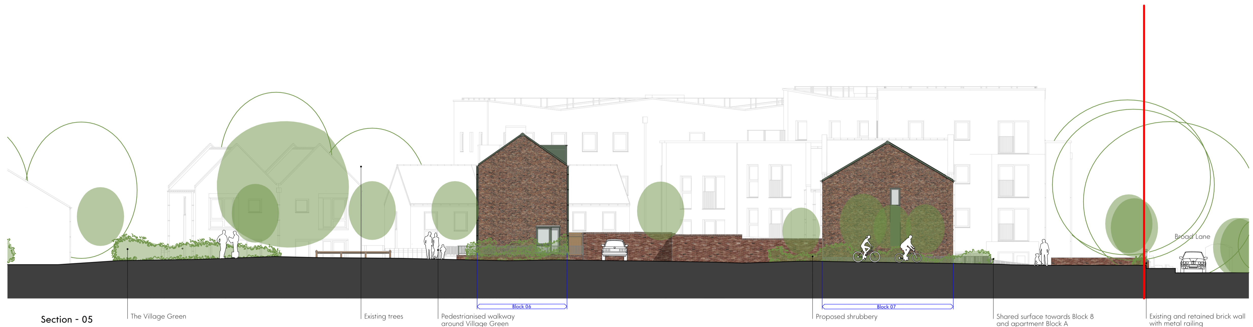
Section - 05