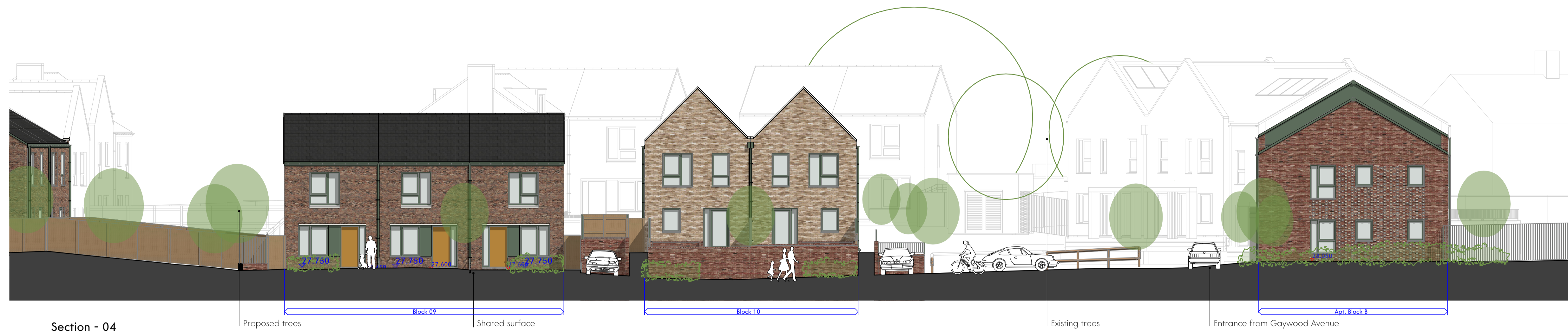
Section - 04