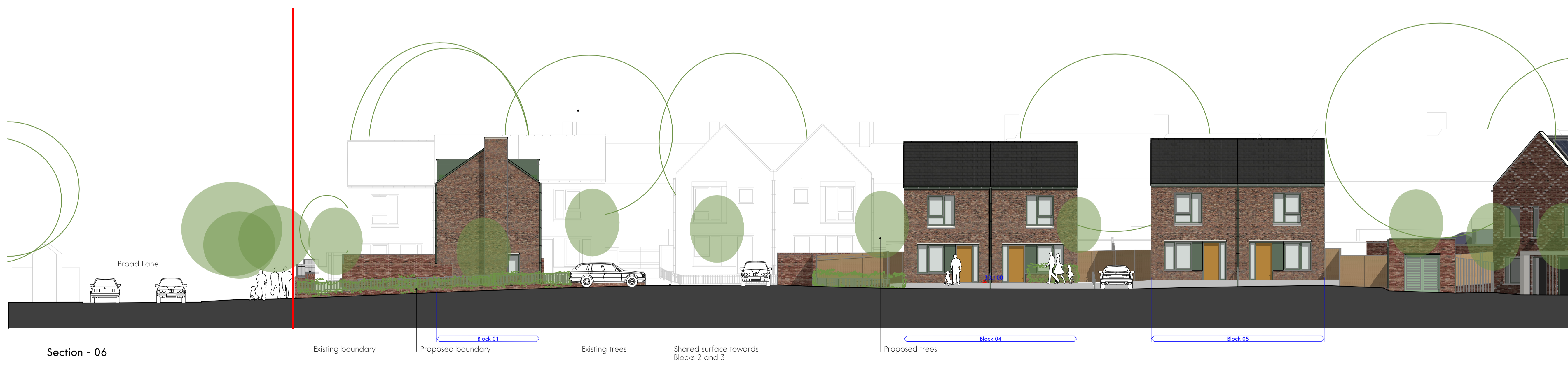
Section - 06

This drawing is the property of GWP Architects. Copyright is reserved by them and the drawing is issued on the condition that it is not copied, reproduced, mirrored or displayed in any way without the consent in writing of GWP Architects. All drawings and specifications should be read in conjunction with the project health and safety plan. Any possible conflicts should be presented to the Planning Consultant. All work to be carried out in accordance with current Building Regulations. Contractors must verify all dimensions at the job before commencing any work or making shop drawings. Written dimensions should be taken. Do not scale off drawing. Do not take digital dimensions from the drawing. Any discrepancies to be reported to the Architect. 0 1m 2 3 4 5 Scale = 1:125 @A1