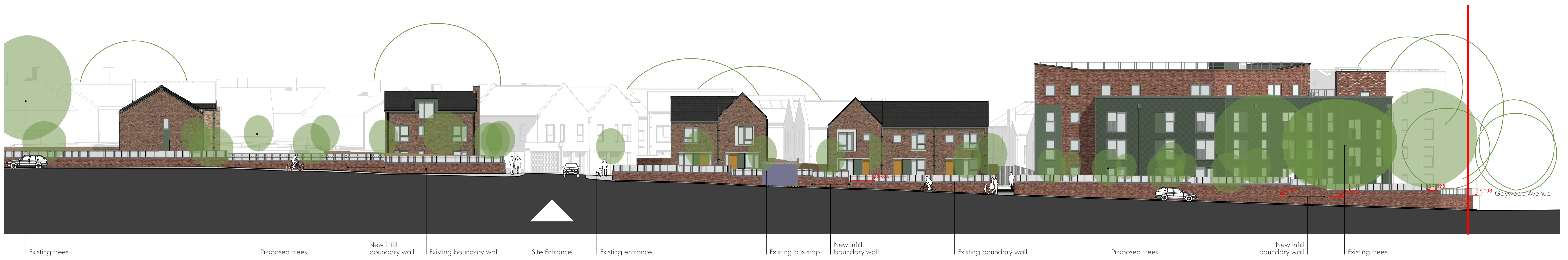
Elevation A-A through Broad Lane