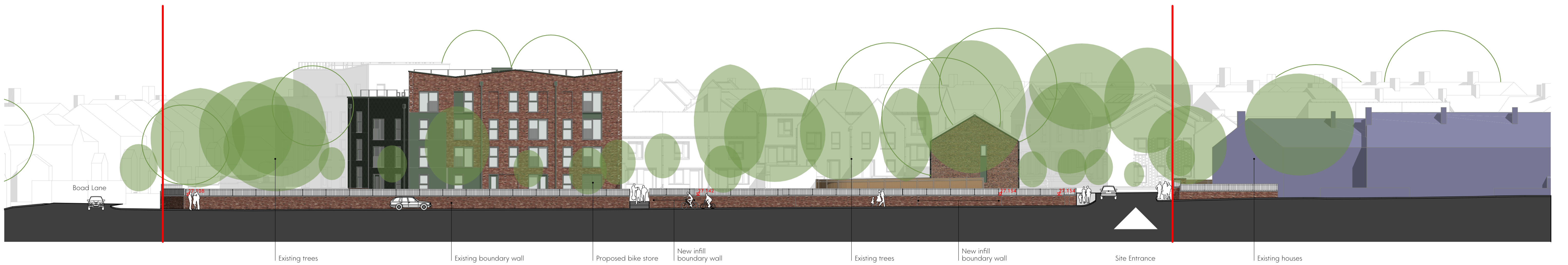
Elevation B-B through Gaywood Avenue