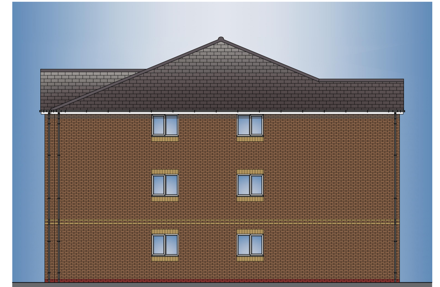
TYPE M1, M2 & M3 Apartments SIDE ELEVATION