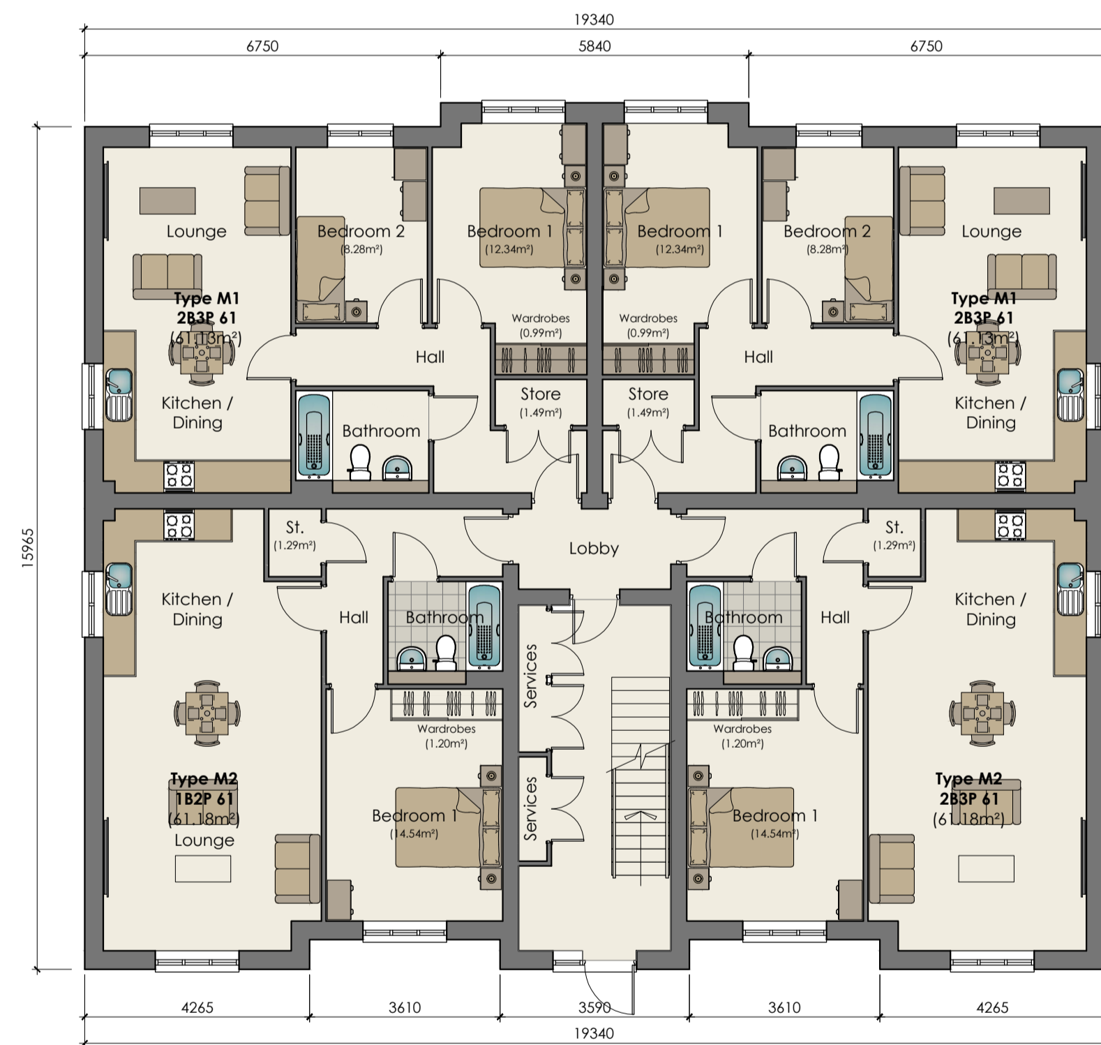
TYPE M1 2B3P & M2 1B2P Apartments GROUND FLOOR PLAN