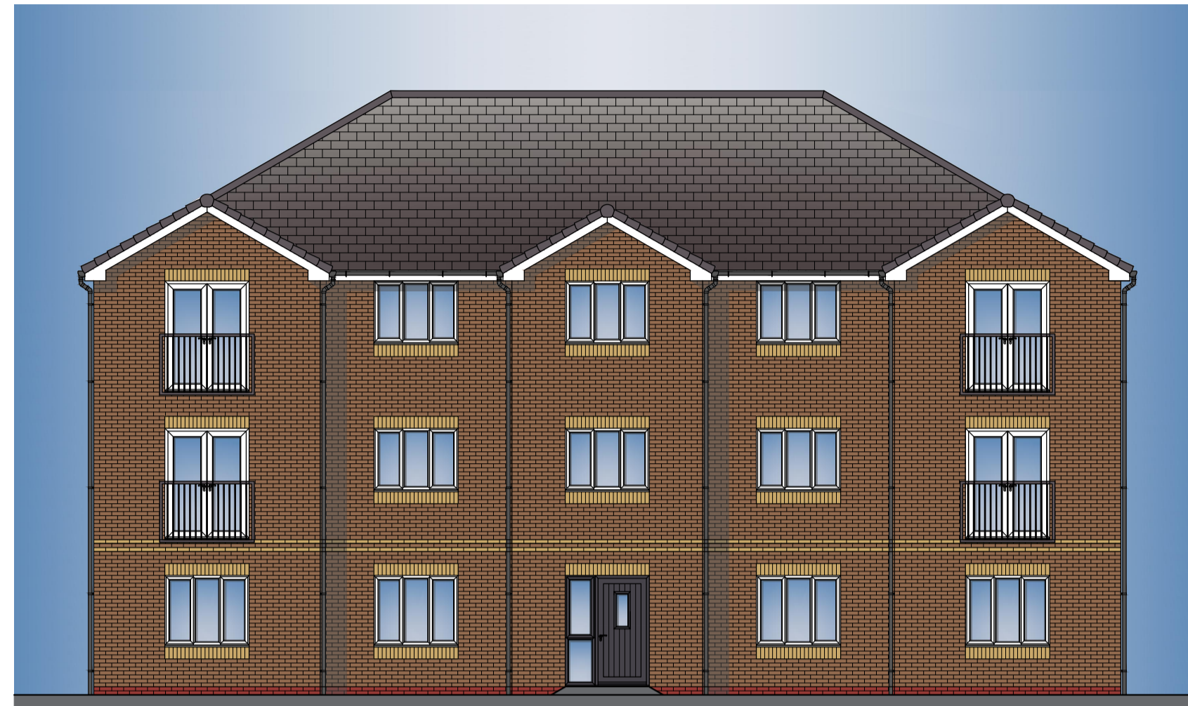
TYPE M1, M2 & M3 Apartments FRONT ELEVATION

TYPE M1 - 02 x 2B3P 61 Apartments - 2 Bedroom 3 Person Apartment (61m 2 ) TYPE M2 - 06 x 2B3P 61 Apartments - 1 Bedroom 2 Person Apartment (61m 2 ) TYPE M3 - 04 x 2B3P 61 Apartments - 1 Bedroom 2 Person Apartment (61m 2 ) NDSS Compliant