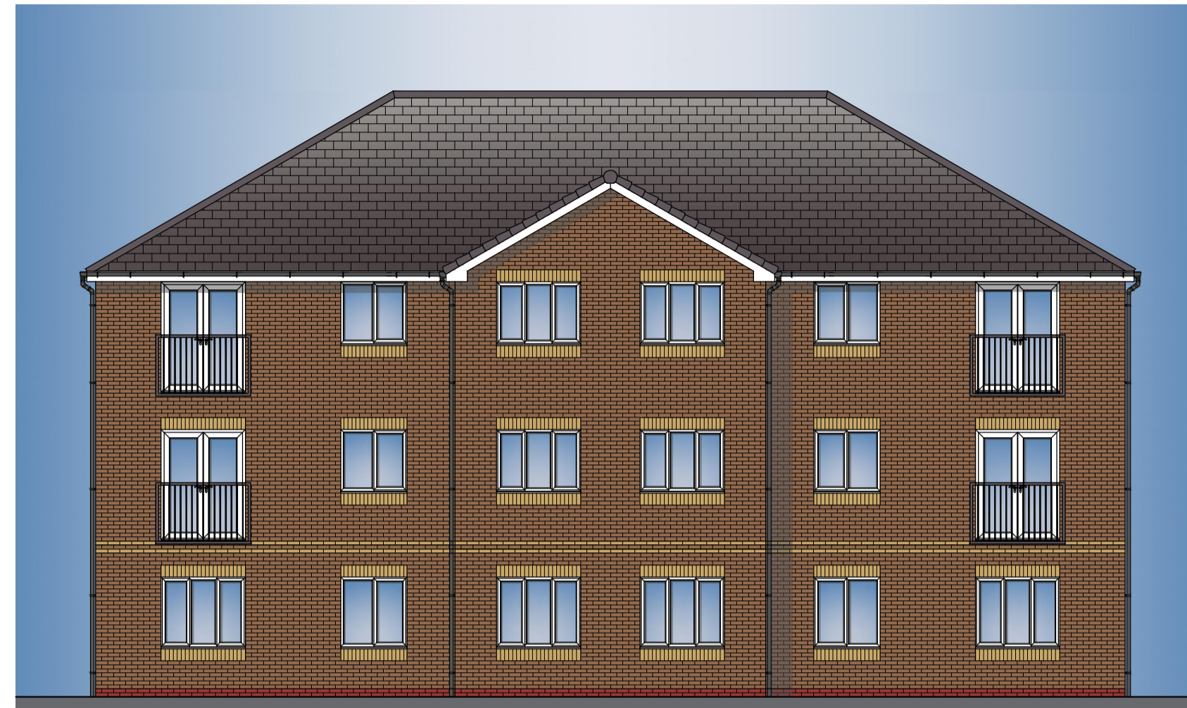
TYPE M1, M2 & M3 Apartments REAR ELEVATION