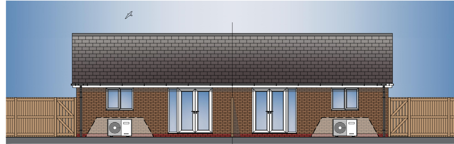
TYPE B 2B3P 61 Bungalow (OPP) REAR ELEVATION