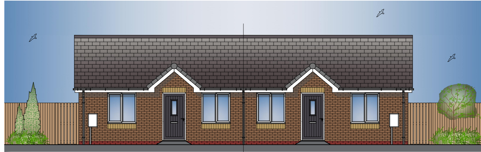
TYPE B 2B3P 61 Bungalow (AS) FRONT ELEVATION