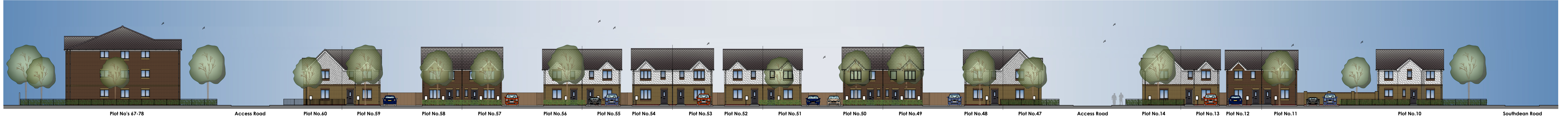
Street Scene Elevation B-B