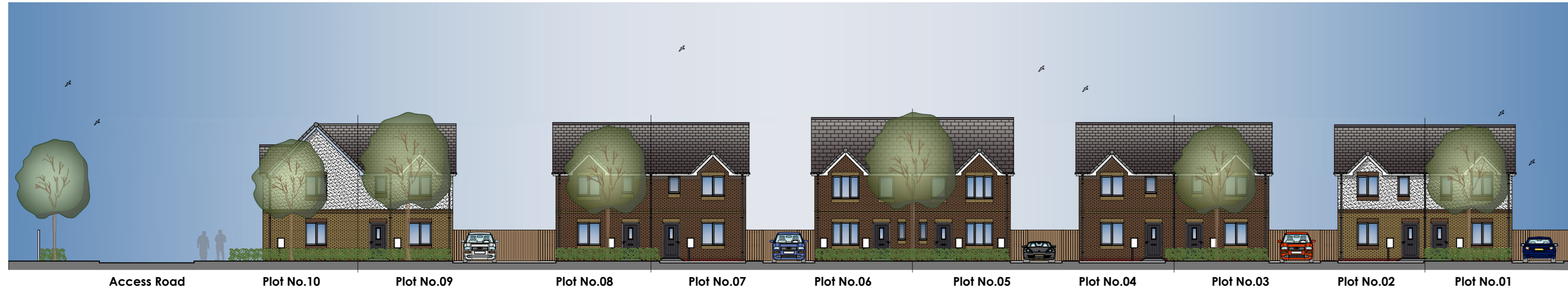
Street Scene Elevation A-A