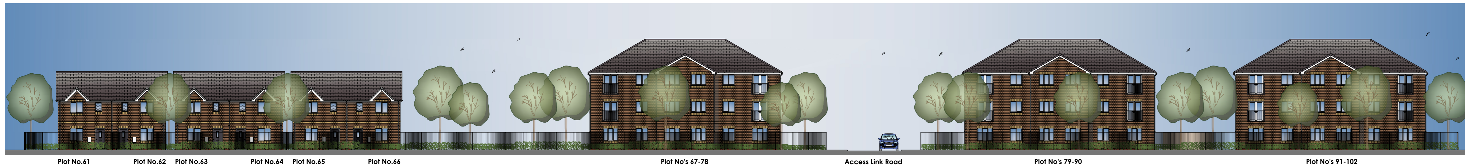
Street Scene Elevation D-D