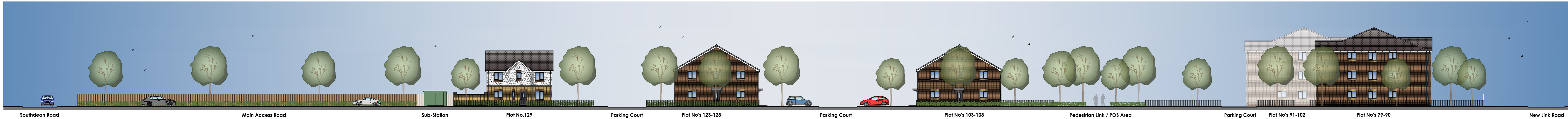
Street Scene Elevation C-C