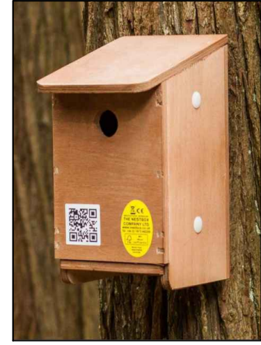
House Sparrow Nest Box 04No. To Be Fitted in Total