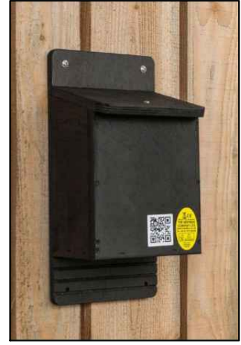
Improved Crevice Bat Box Double Crevice / EQ 04No. To Be Fitted in Total