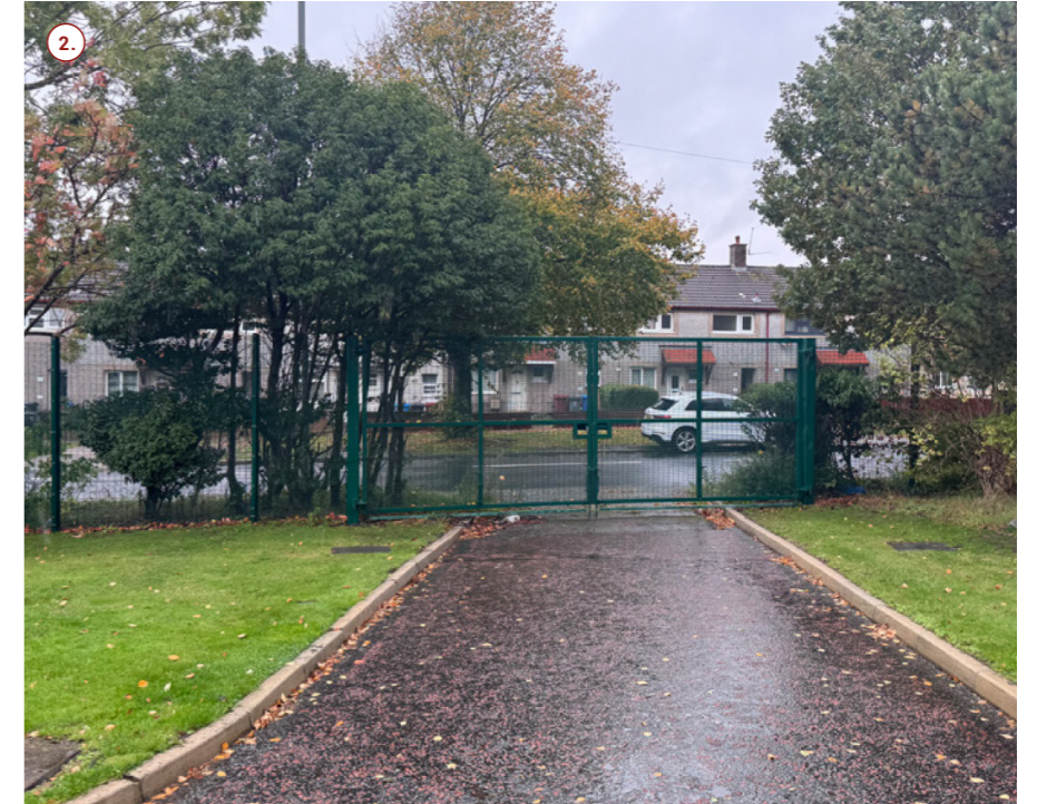
EMERGENCY ONLY ACCESS FROM SIMONSWOOD LANE