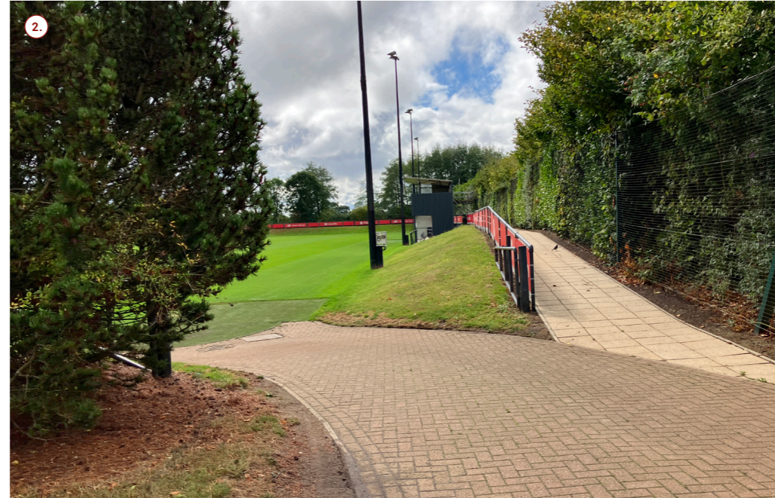
SHOW PITCH SCREENING TO SIMONSWOOD LANE