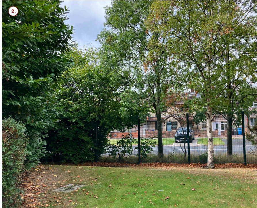
BOUNDARY TO SIMONSWOOD LANE