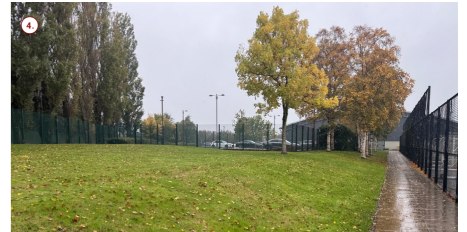
NORTH EASTERN BOUNDARY TO ARBOUR LANE LOOKING BACK TO EXISTING INDOOR PITCH