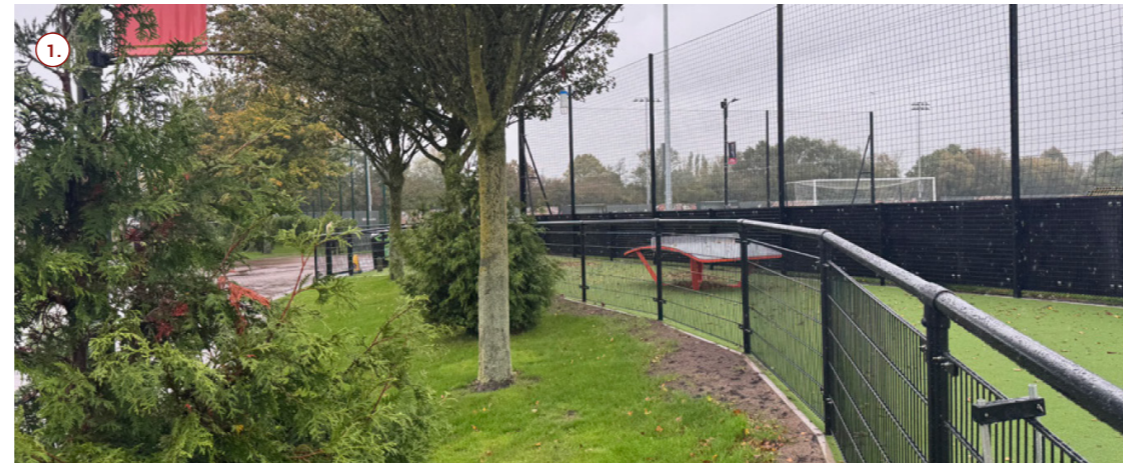
NORTHERN BOUNDARY TO AXA TRAINING CENTRE