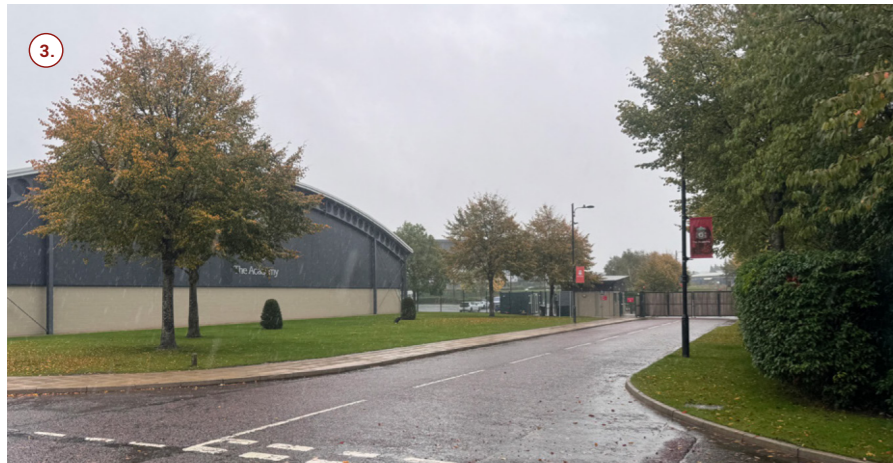
ENTRANCE AND BOUNDARY TO ARBOUR LANE