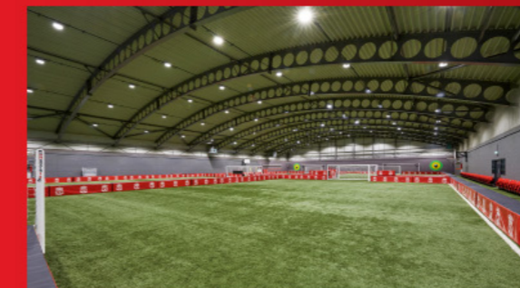
Photograph of the current indoor artificial pitch

The expansion and refurbishment of the Academy will be the first major works to the building since it was completed in 1998. Following improvements to other aspects of the LFC's infrastructure, the Academy's redevelopment will provide the younger players with access to top class facilities as they progress through the sport. The redevelopment aims to bring LFC's Academy facilities in line with top flight clubs across Europe to better our talent attraction.