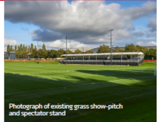
Photograph of existing grass show-pitch and spectator stand

The Academy has been permanently based in Kirkby, east of Simonswood Lane and south of Moss Lane, since 1998.