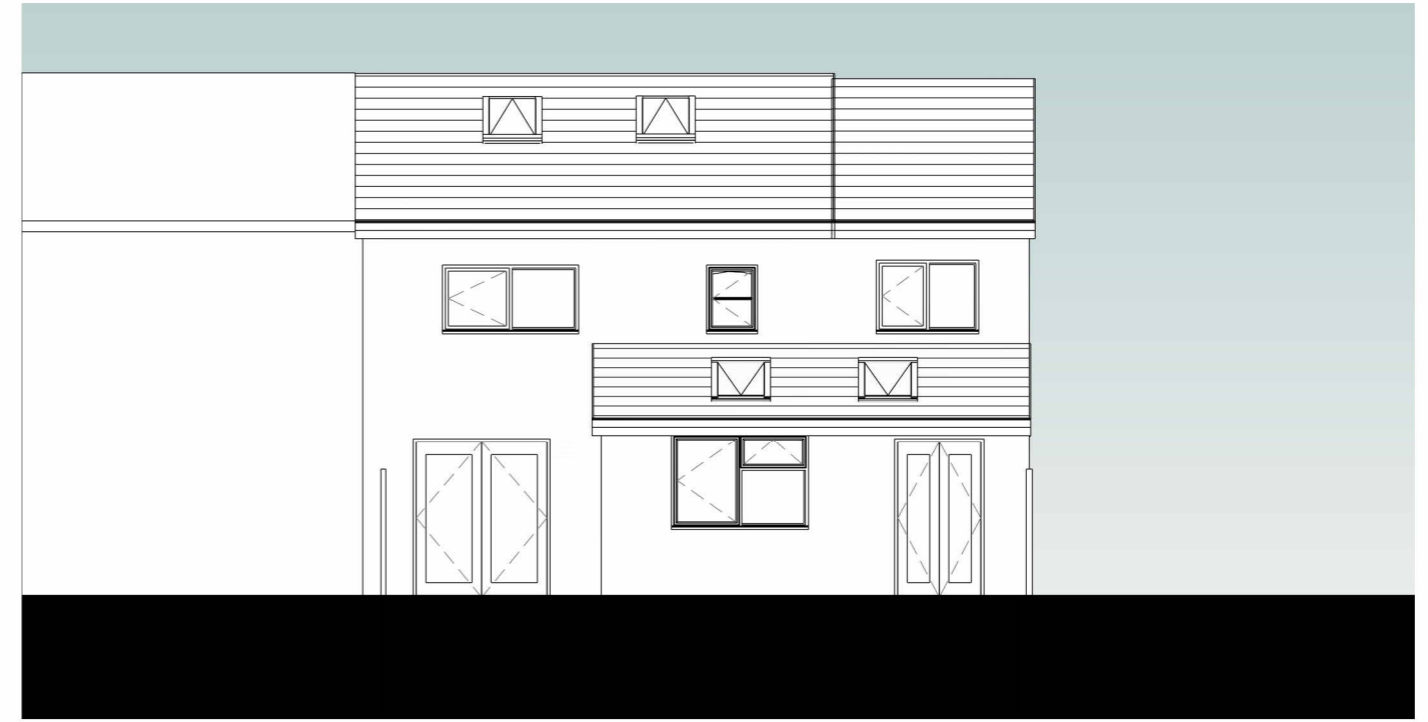
2 Proposed Rear Elevation 1 : 100