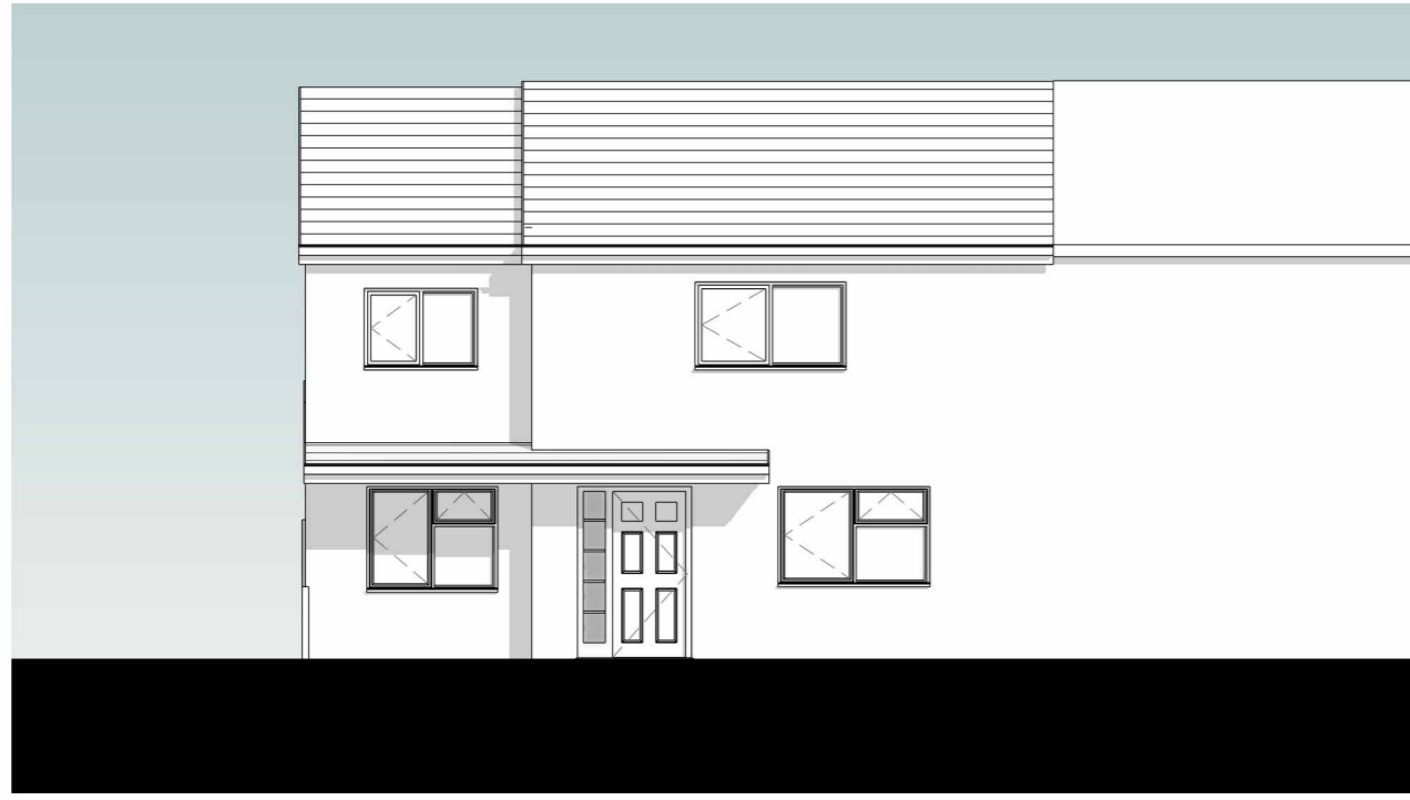
1 Proposed Front Elevation 1 : 100