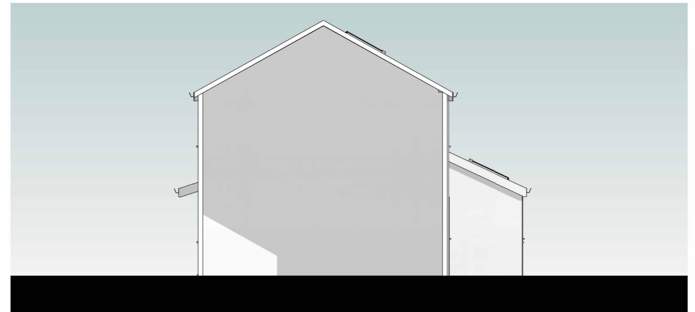
4 Proposed Side Elevation 2 1 : 100