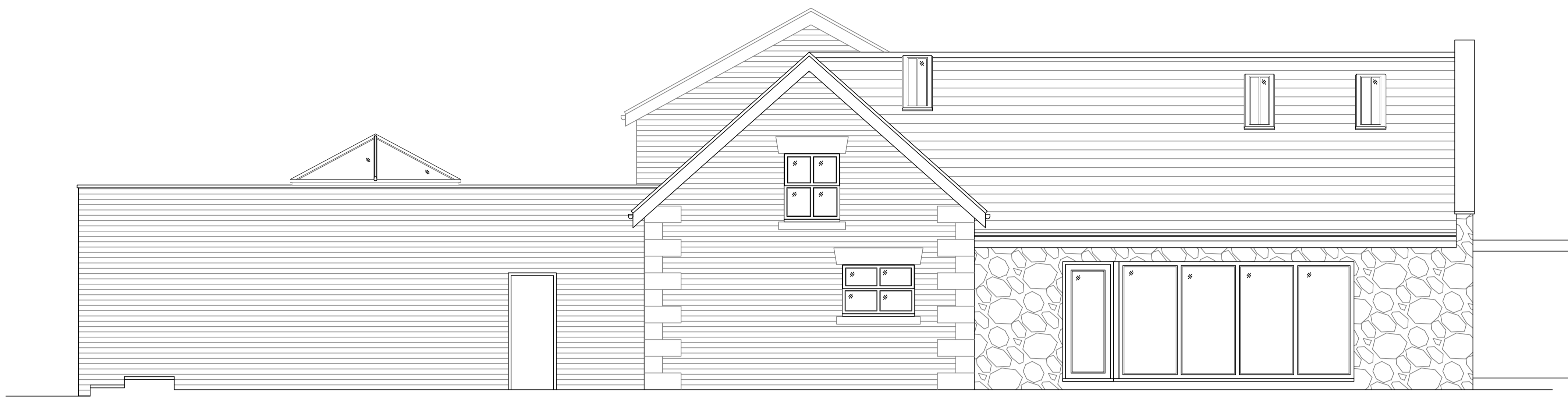
PROPOSED REAR ELEVATION (WEST)