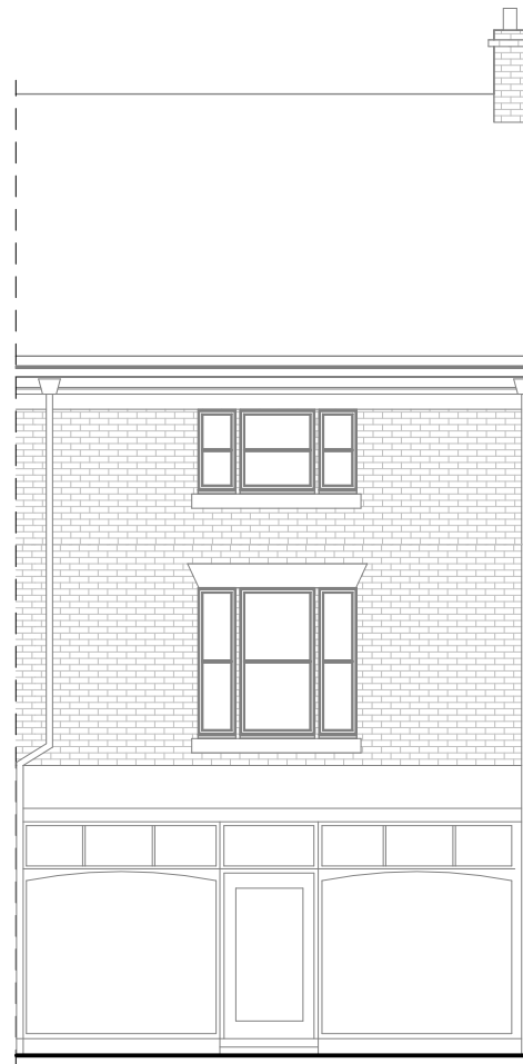
1 Front 1 : 100